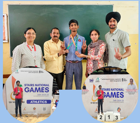
Stairs National games