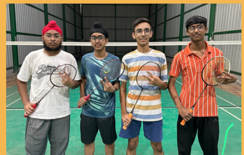
Badminton Gold in zonal