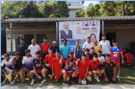
Sansad Khel Mahotsav (Handball) sub junior boys - First position