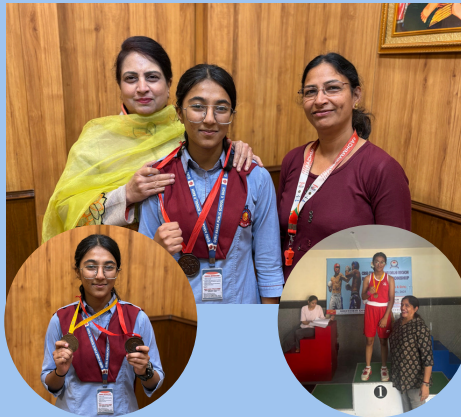
Cbse Boxing championship Gold