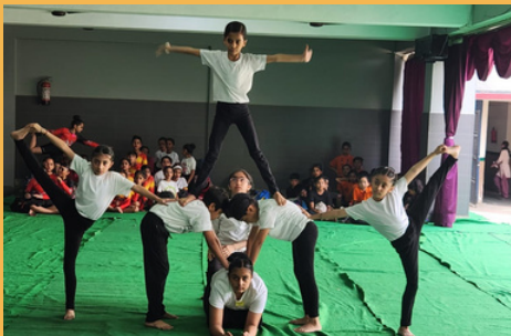
Dav public school interschool competition