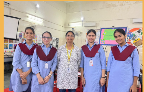
Zonal carrom board