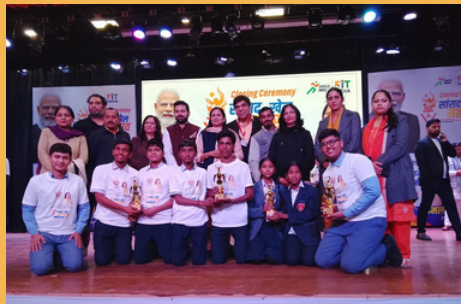
Sansad Khel Mahotsav (Handball) Junior Boys - second position